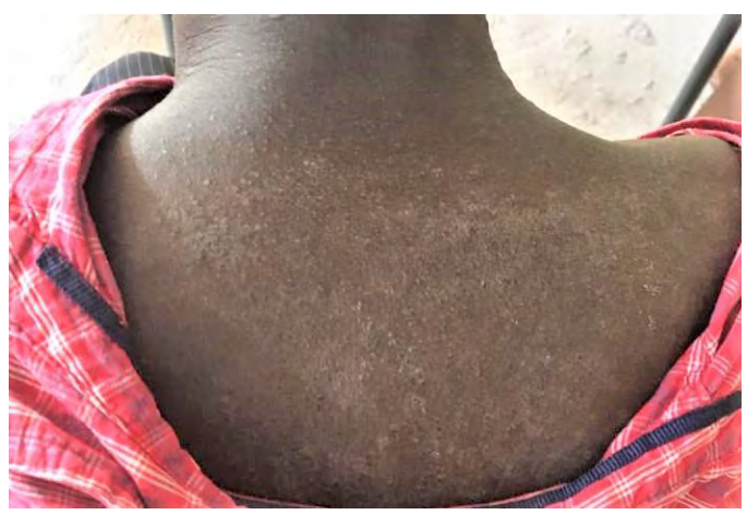
Girl with Rash

On August 8<sup>th</sup> Nurse Myrdred Kaminskie Delva conducted the second all Haitian open-air clinic. Many kinds of conditions were presented and treated. Among them were a child with one nasty looking arm, 27 people with rash or bad skin problems and 16 with urethral and vaginal infections. A class is planned for the last of these.