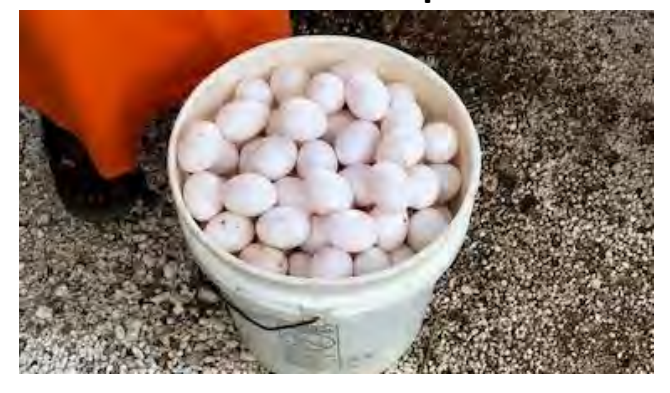
Chicken Farm Update

Last month we reported that plans for a chicken farm needed more refinement to ensure solvency. The Haitian Fond Doux Foundation Committee have sharpened their pencils and explored some different options. They believe that by mixing their own feed grain they will be able to provide cheaper feed costs without compromising quality. They believe that they have also found a way to sell their eggs at a higher price to be offered at a nearby market. They believe they have found a way both to improve income and to decrease costs. While there are still questions to be answered, the possibility of an egg farm for Fond Doux is looking more promising than it did at the March Foundation Board of Directors meeting.