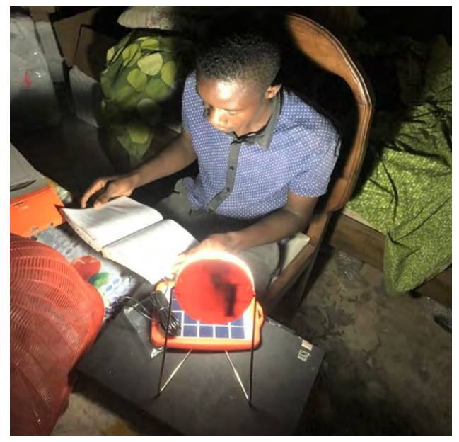
Haitian Student Studies at Night

Are you looking for a very modest investment in the Haitian future? For just $100, you can provide three students the ability to study after dark by providing them with a low cost, long lasting solar lamp. There are probably 100 to 150 homes in Fond Doux with students that could benefit from a solar lamp. What a blessing for so little cost! How do you study without electricity? A solar lamp!