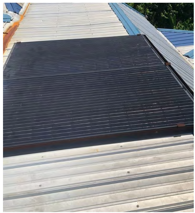
Solar Power Roof Panel

Other items on the agenda for the next trip might include the proposed library, which is our expected 10th Anniversary project, the enlargement of the soccer field and its drainage problem, and plans for developing a clinic. We are exploring an underutilized clinic building owned by the neighboring Wesleyenne Church as a possible site. It stands virtually empty.