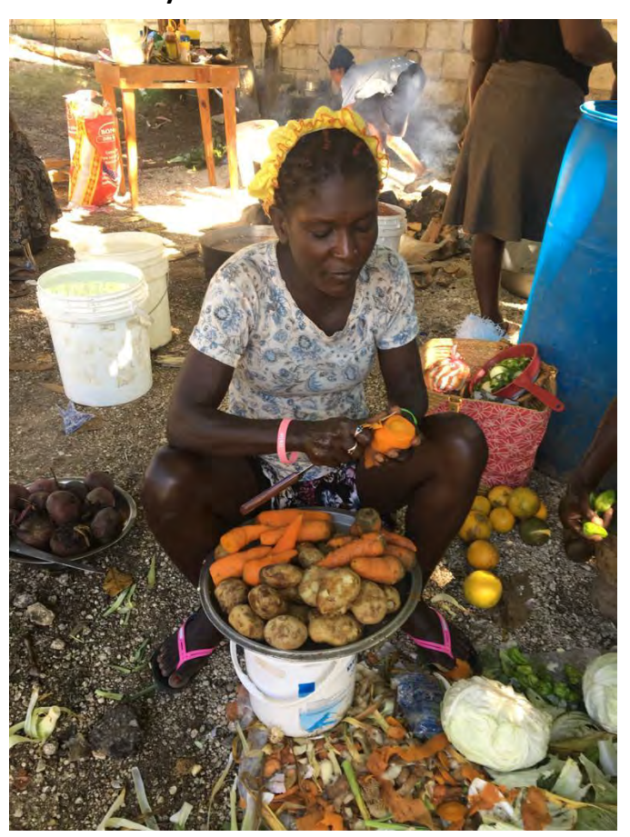
Haitian Food Preparation

not have the results as yet. Malaria is borne by mosquitoes. The best-known ways to fight it are drying up mosquito breeding spots and use of mosquito nets while sleeping. A large number of mosquito nets were previously purchased by the Foundation and distributed by the Haitian Committee. They also had dried up previously known breeding areas. The Haitian committee wishes to know what was overlooked.