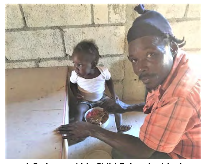
A Father and his Child Enjoy the Meal

The Haitians prepared for 500 people. Although they believe there were actually over 500 people present (an exact count was not made), they had enough food. Many of those that came were children. The people needed to come in shifts in order to serve them all. The preparation of the food was a community undertaking, beginning already the night before.