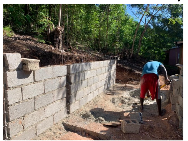
Building the Structure