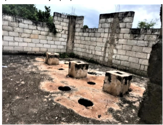
Present Public Latrine

The Foundation has several projects in various stages of development. The opening of a clinic is imminent as is the start-up of a chicken farm. Others planned or under development are a new public toilet and a clean water project as part of community responses to malaria and typhoid. An astonishing 62% of the people recently surveyed in the village suffered from malaria, 46% during the last year and almost 50% have suffered from typhoid 30% in the last year – an epidemic of major proportions.