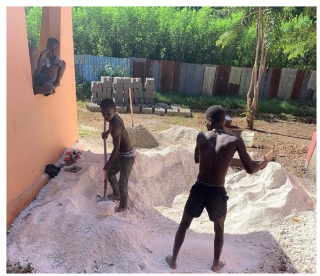
Starting to Build Near Grain Mill

Another anonymous donor gave an additional $250, which the Foundation used to completed the building. A simple one room house has been constructed.