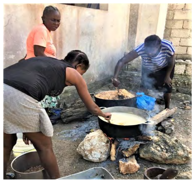
Christmas Meal Preparation

The Haitian FDF Committee asserted significant leadership in providing relief by arranging two feeding programs during the acute food shortages caused by demonstrations. The first was emergency relief for 50 families during the October shut down of the economy. The second was the Christmas party, which fed over 400 vulnerable old people and children. The menu included chicken as well as beans and rice. That was a genuine treat. These feedings were made possible by gifts to the Foundation.