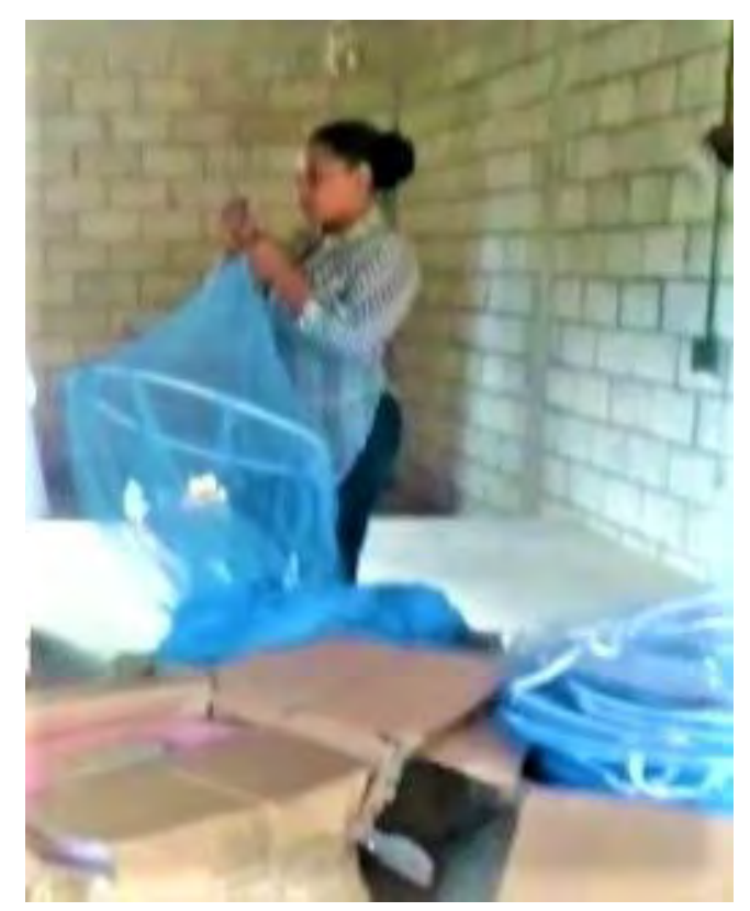
Gernite Demonstrating Mosquito Nets

The FDFC arranged a class on malaria and coordinated the purchase and distribution of mosquito nets.