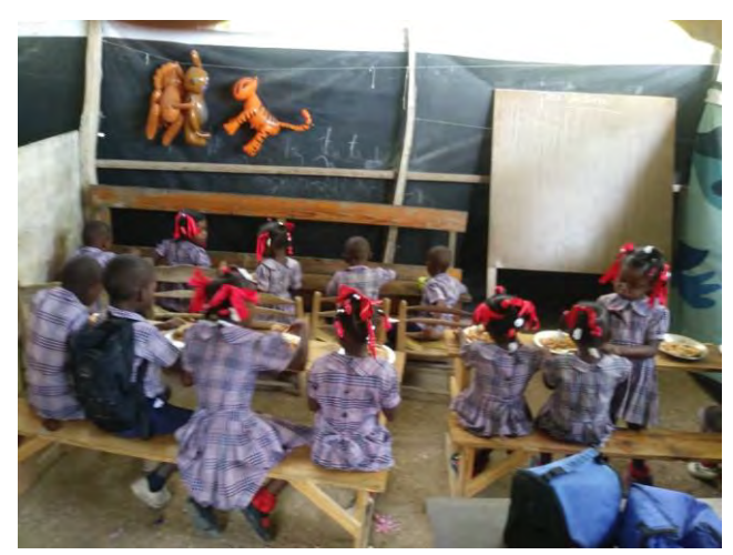
Platon School Children with New Year's Dinner

The Fond Doux Foundation Committee further took the lead in suggesting to the FDF an emergency grant for the School at Platon. The school was in such desperate financial shape that it would have closed without our assistance. This grant was made possible by a generous ($2500) donation from an out of state (Pennsylvania) donor.