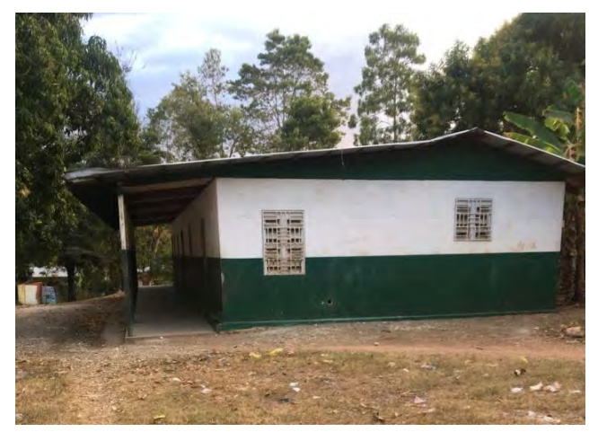
The Clinic Building

An arrangement to cooperate with the Wesleyenne Church on the proposed clinic project is being arranged by the FDFC. The clinic building, erected by Samaritan's purse, is owned by the neighboring Wesleyenne Church. Members of the FDFC have recently toured the building to see what is there. It is a very good building in good shape and is presently unused – very promising!