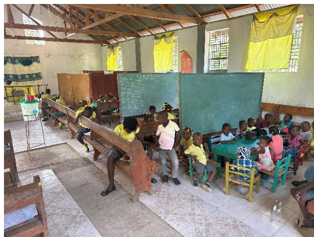
The Methodist School