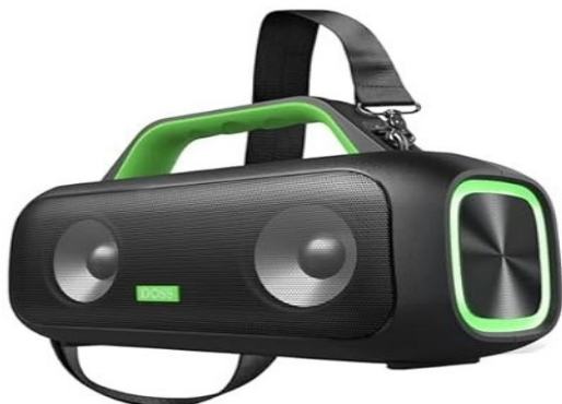
Speakers for the English Clubs

For the English Clubs he brought along two wireless portable Bluetooth speakers, one for each English Club. These are used to enable the students to listen to native American speakers. The playtime is 26 hours with rechargeable batteries.