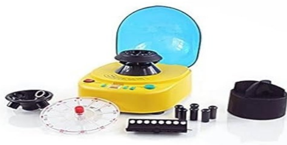
Centrifuge for the Clinic

For the laboratory at the clinic, he brought along a small centrifuge, useful in the laboratory for blood tests.. We are trying to make the lab as fully equipped as possible.