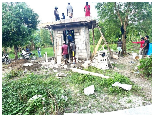
Well House Costruction