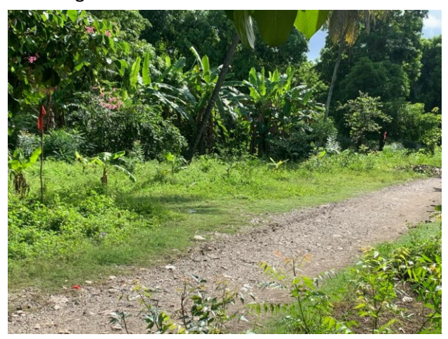
Land across from Methodist Church

Since 2022, the Methodist Church of Fond Doux has been the principal partner of the Fond Doux Foundation. Community events sponsored by the Foundation have been held at the Methodist Church including this past year's Christmas meal. The Foundation needs a building to host community events and the church has a great need for a building to house at least part of its school. We will attack both needs together.