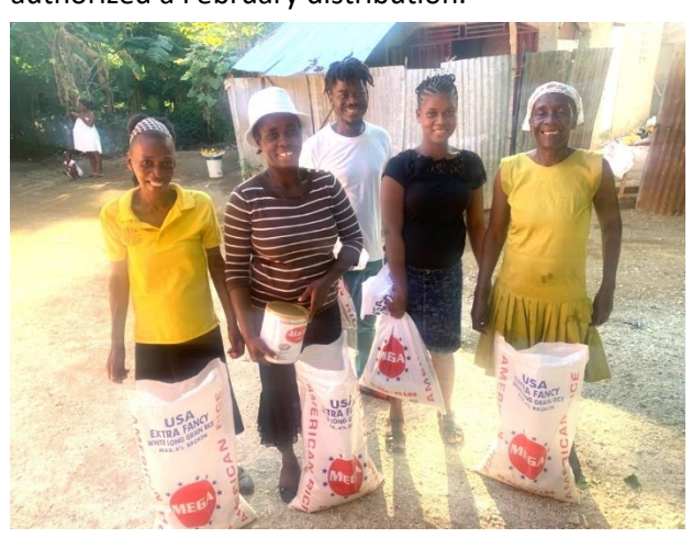
The FDF distributes Food to the Hungry

However, with access to food difficult, many people become hungry. The Executive Director asked the FDF to intervene. He asked the board to provide another emergency food distribution to the neediest and most vulnerable of Fond Doux. So, the board authorized a February distribution.