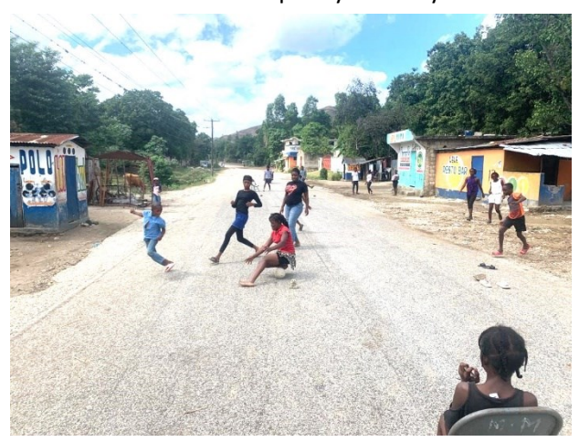
Kids Play on the Highway

On February 9<sup>th</sup>, our Executive Director said this to the board: "The wind of panic, the wind of fear and the wind of despair, unfortunately, has been blowing across the entire Haitian territory for the last two weeks. Believe it or not but people are suffering from the lockdown which has paralyzed daily activities!"