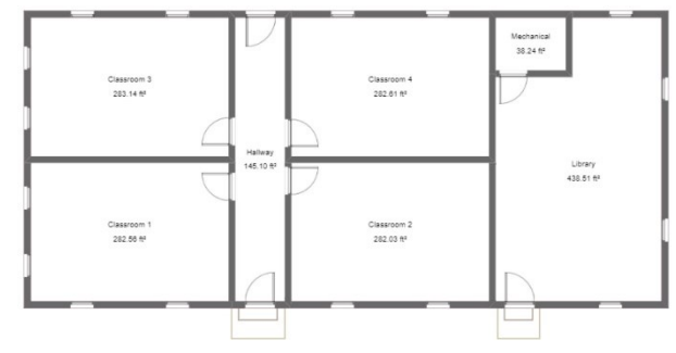
Possible Floor Plan

With the blessing of the leaders of the Methodist Church of Fond Doux, the Foundation purchased land across the road from the church. It was previously eyed by the church as a location for its school. The Foundation now plans to build a community center that can be used by the school in the mornings to house a significant portion of the Methodist School. In the afternoon and evenings, it can be used for community events. A library section could perhaps also hold some community events even when school is in session, or in emergency a clinic.