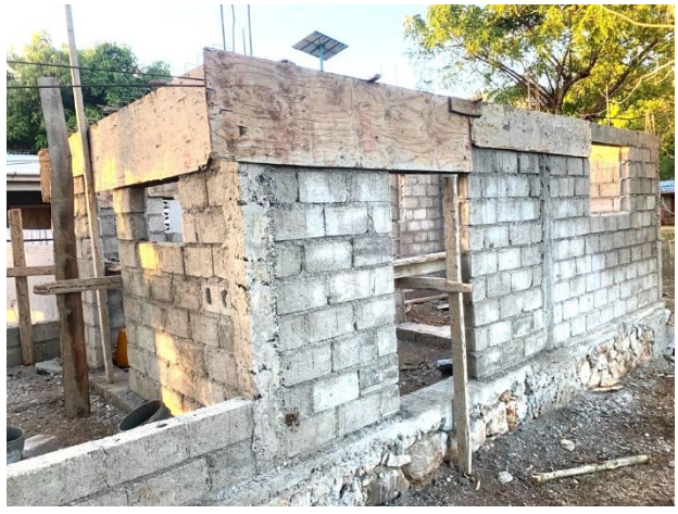
The House Progresses

The materials for the house were provided by the Foundation in exchange for labor on some future construction projects. We believe this is a win/win solution for both him and the Foundation, reducing the cost for both.