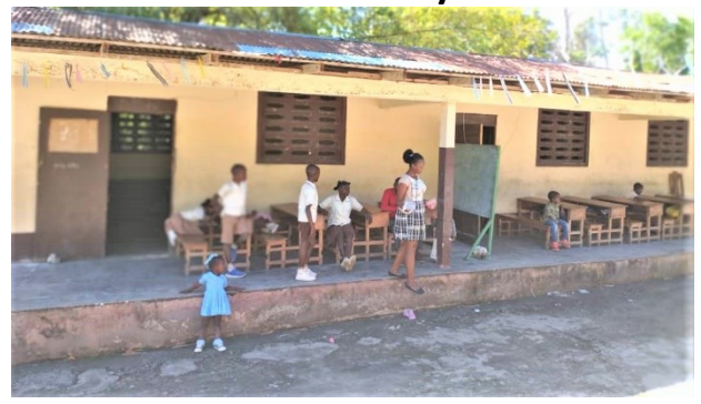
Hope for Tomorrow School, Ravine Parc

Although we have received many urgent requests to help the Ravine Parc School (literally begging us) to prevent its closure, we have not included the basic minimum of $6,000 in our annual budget because we already need additional resources to meet our present commitments! Several times the Foundation has given the school an emergency grant from a gift designated by a donor for the school. However, to begin subsidizing this school requires raising an additional $6,000 to $12,000 annually that we have no idea from where it might come. Although we are acquainted well with people (Our English Club is hosted by the school), we simply could not make a commitment, only issue a plea. The school has grades K thru 6<sup>th</sup> and fortunately a substantial building. How long the school can survive with teachers that are virtually without pay is unknown. It is on our prayer list. Please add it to yours.