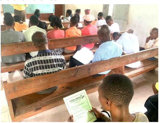
Teachers as Students on Day One

Many of the teachers in these schools lack formal teacher education. So, teacher training is a necessary part of our design for quality education for the students at all three schools. This is the second year that we invited the teachers from the Methodist School and those at Ravine Parc School to join in the training sponsored by the Foundation for the teachers at the Platon school. The training was held at the Methodist Church of Fond Doux.