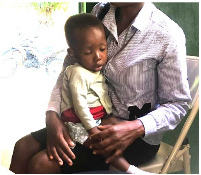
Malnourished Child at Fond Doux Clinic

Recently a child was brought to the Fond Doux Clinic with severe malnutrition caused by his parents' inability to afford food for their children. The great tragedy is that the parents came to Fond Doux to seek a better life. They were told by a trusted friend that there was a job for them in Fond Doux. When they arrived, however, they were told that the job had already been filled, but that they had another job for the parents in a school. Unfortunately, the different job also turned out to be ill-fated. School jobs in Haiti have small pay and schools are notorious for not paying their employees all of their promised pay. This turned out to be true again. Meanwhile, the child became severely malnourished. A Genuine tragedy!