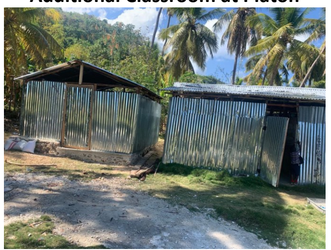
Stand Alone Room on the Left

The school at Platon is one of the major projects of the Fond Doux Foundation. It serves 58 students pre-school through the 6<sup>th</sup> grade. Last school year we added a fifth teacher to the school, but we had only 4 classrooms. A new classroom was built and is pictured on the left.