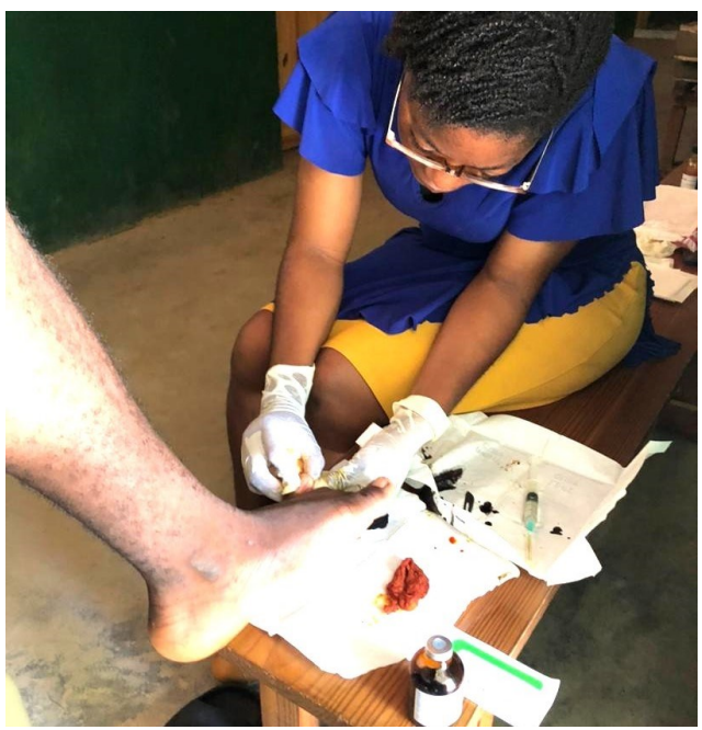
Removing a Pin from his Foot

The Fond Doux Clinic receives a variety of patients. Recently, a man came to the clinic with a broken-off pin stuck in his foot. The nurse needed to anesthetize the area to dig it out. We were glad we could deal with it.