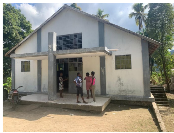
Methodist Church of Fond Doux

create a more favorable educational environment The Foundation is committed to making this a reality. But it is a challenge.