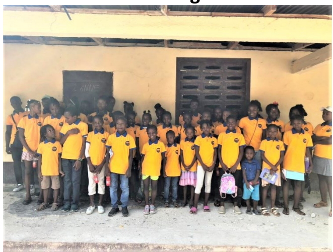
In Front of the Ravine Parc School

The Ravine Parc English Club has grown to nearly 50 students including both Elementary and High School Students. They have various levels of English proficiency. On July 15<sup>th</sup> each of the club members received a T-shirt to show that they are members of the Club.