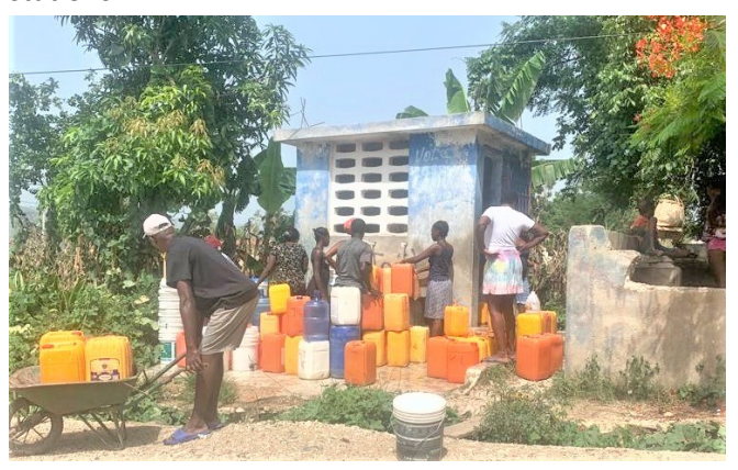
Reopened Water Station

Water. The Foundation has repaired a village water pump, tested water for contamination and in 2022 repaired a water main to open up several water stations.