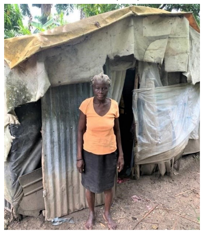
Tarp Home -- Another Person in Need

sides. The Foundation has often been told: it is wise to do fewer things and concentrate on those, but we are always being challenged by the many needs of our friends and neighbors. Shelter has not been our number one priority, but when someone has no place to get out of the weather and no dry place to sleep, it becomes a number one goal for them. We do what our donors allow us to do! Small steps help!