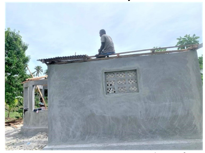
Construction Day 72 Putting on the Roof