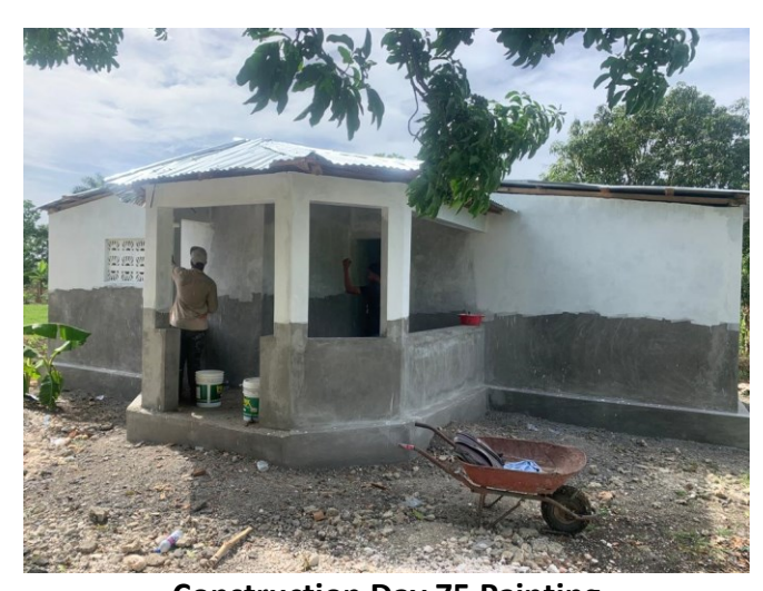
Construction Day 75 Painting