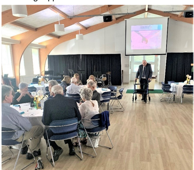
Presentation on Fond Doux Foundation

On January 15<sup>th</sup> and February 19<sup>th</sup>, the board of the Fond Doux Foundation met to consider the next steps for the Foundation. A very important step is to broaden the base of funding for the Foundation. At the present time we are far too dependent upon a small (tiny) group of key supporters. The loss or death of anyone of them could cause severe financial difficulties for our work. Establishing a secure broader base of financial support is essential. The Foundation is hoping to find groups, churches and organizations that will commit to continuing support as well as individuals.