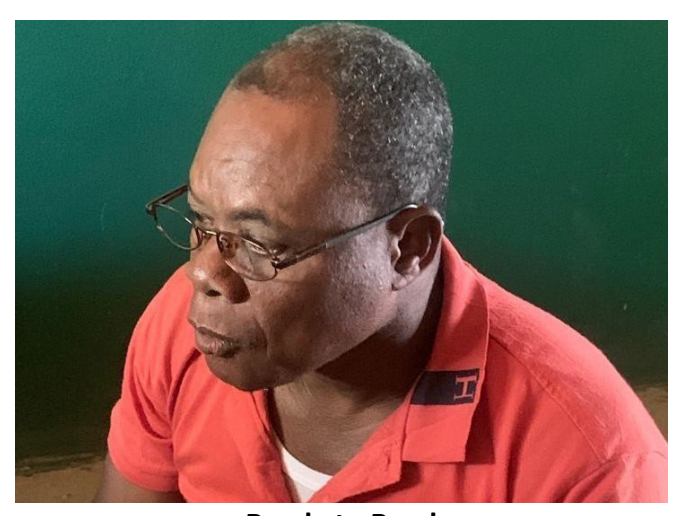
Ready to Read