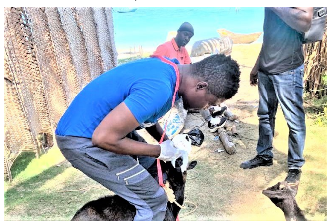
Deworming the Goats