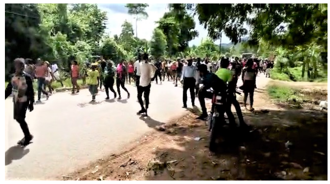
Protest in Fond Doux

While violent demonstrations have been present in Port-au-Prince and ever-increasing gang activity has hit major cities and certain areas, demonstrations had generally been absent in Fond Doux. This changed in late August. Fortunately, demonstrations in Fond Doux were peaceful with hundreds of people gathering to march to protest the high price of gasoline and food. Much of this has come about because of the