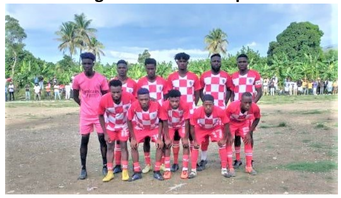
Fond Doux Soccer Team

The Fond Doux Community soccer team ended a very successful season. Congratulations to the champions! Uniforms and shoes were purchased by the Foundation from special contributions designated for that purpose.